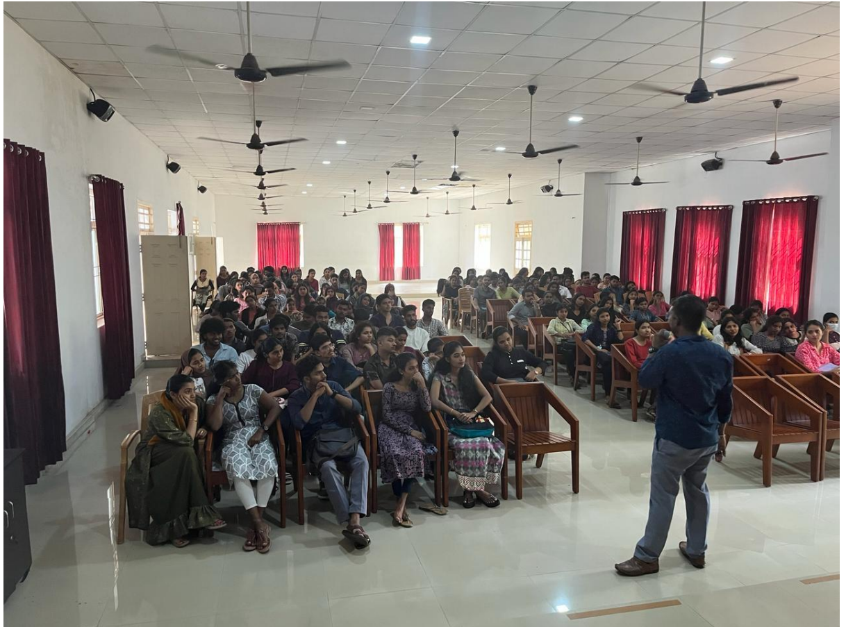
3. ZGC Career fair 2024 on 14 th March 2024